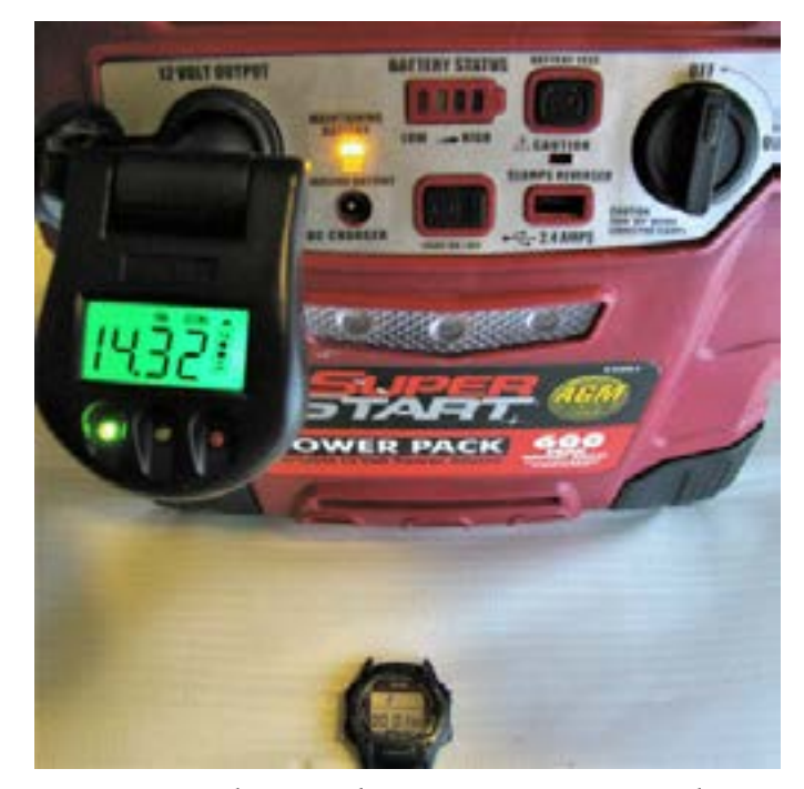
Figure 4: Voltmeter showing maintenance voltage

The bottom line is, verify (measure) your charger's voltage if you will leave it powered indefinitely. It's easy to check battery voltage with a multimeter, or with a voltmeter that plugs into the 12V outlet (see Figure 4). If the voltage appears acceptable, check it again a few hours later and a day later. If not, unplug it for storage.