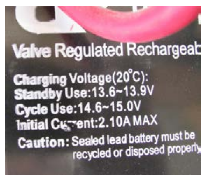
Figure 2: Battery charging specifications.