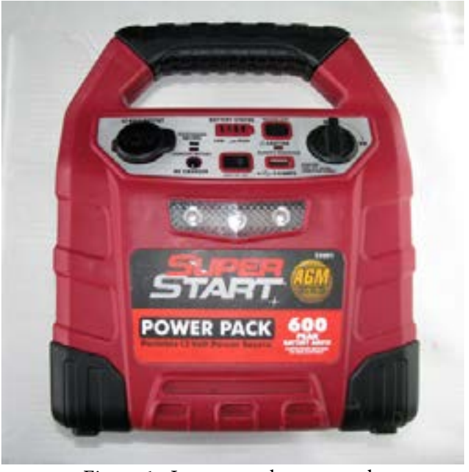
Figure 1: Jump-start battery pack.

Some hams use a jump-start battery pack for powering their radios in the field. The unit shown in Figure 1 has many useful features such as a 12V power outlet, USB charging outlet, state-of-charge indicator, flashlight, built-in 2-stage charger (accepting 120VAC or external DC power supply), charging mode indicator, and of course, attached cables for jumpstarting a car. The powerful-sounding 600 Peak Amps are sourced by an internal 7 ampere-hour (AH) sealed lead acid (SLA) battery.