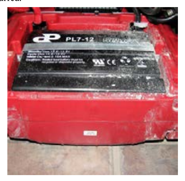
Figure 3: What does not belong?

In practice, the two-stage charger in this unit falls short of ideal. The first stage illuminated the "charging battery" LED and charged until the battery voltage rose 14.4V. The second stage illuminated the "maintaining battery" LED, let the battery voltage drift down to 13.2V, then charged more slowly. During an eighthour span, the stage-2 voltage rose to and settled at 14.4V, well above the recommended Standby Use range. Continued charging at 14.4V will overcharge and damage the battery. There is evidence this occurred.